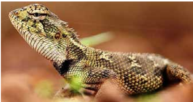
Fig. 1. Brachysaura minor : adult male

Limbs rather long, weak, not compressed; covered to the tip of digits with strongly keeled scales. Fingers and toes short, weak, fifth shorter than first, claws weak. Anterior limb when laid backwards reaches to the