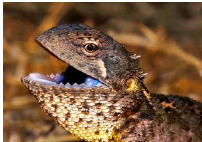
Fig. 3. Brachysaura minor : adult female

The color pattern of the lizard blends it with its stony dark gray soil. In juveniles, light-dark blotched pattern is more