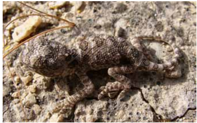
Fig. 5. Brachysaura minor : in resting posture

Sexual dimorphism and reproduction: Brachysaura minor female is larger than male, has prominent pendulous abdomen; becomes bright crimson during breeding season (July-August), with dusky olive to light brown back, and a deep black shoulder fold (Fig. 3). Sexually excited female seeks attention of male by her body movements. Cockburn (1882) observed a receptive female "taking decided advances on an unconcerned male, by siding up to him in a most insinuating way by crouching wriggling motion of her body, and ceasing him by its nuchal crest." 4-6 eggs