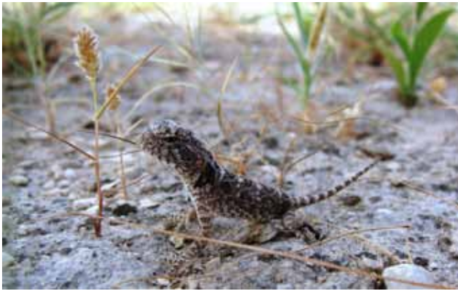
Fig. 4. Brachysaura minor : in natural habitat

compact, blotches of middorsal row are separated by narrow white transverse bars (Fig. 2a) or are confluent with each other (Fig. 2b, 2c), and are laterally edged with white.